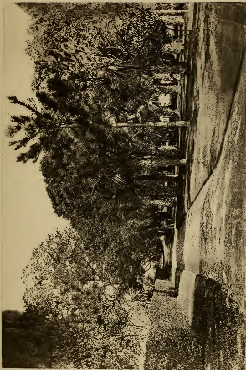
PALMETTOS - OAKS AND PINES